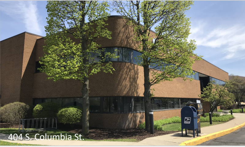
404 S. Columbia St.

348 & 404 S. Columbia, 501 E. Monroe | South Bend, IN 46601