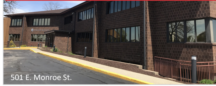
501 E. Monroe St.