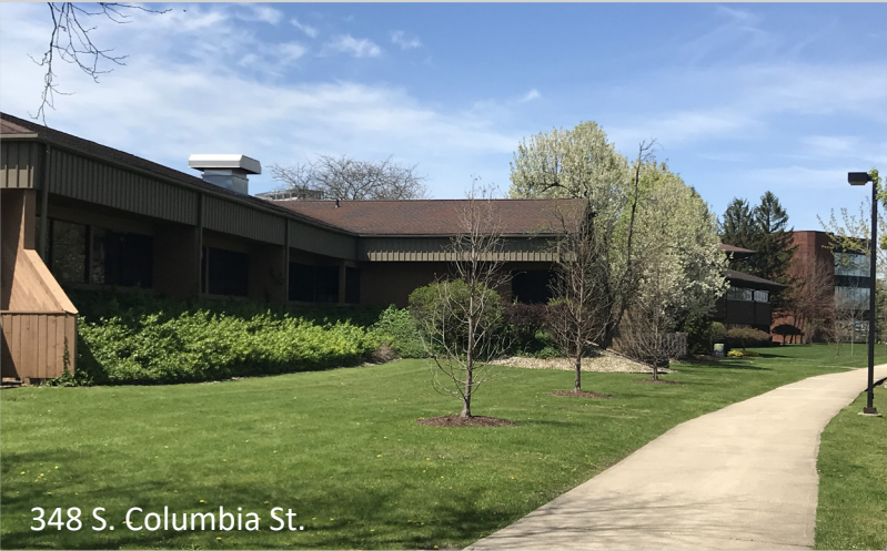
348 S. Columbia St.