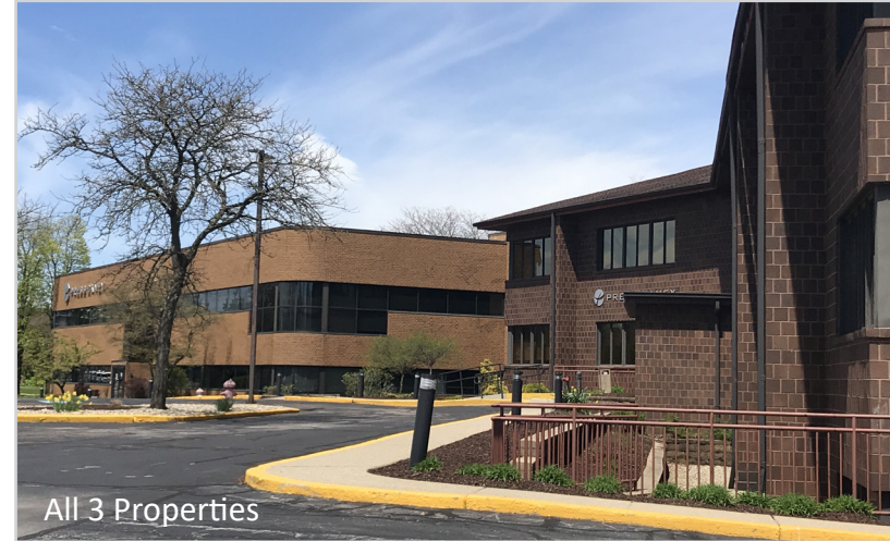
All 3 Properties